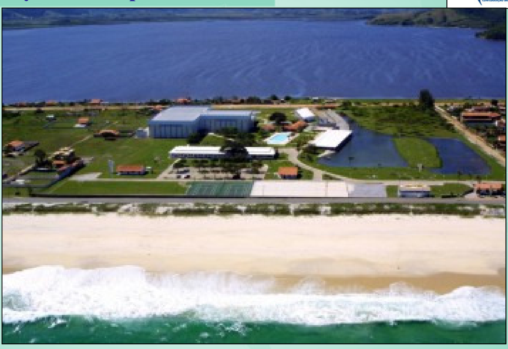
The VDC-S is located in Saquarema City, with an area of 108.000 m<sup>2</sup>, only one hour from Rio de Janeiro City.