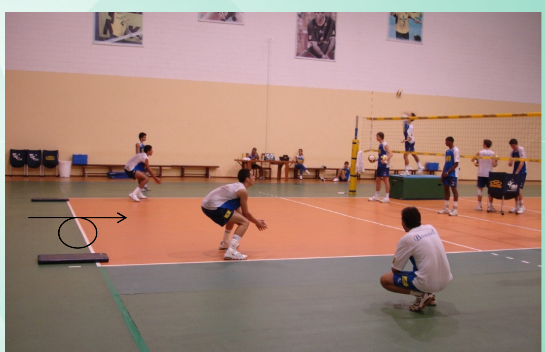
Roll and prepare to defense